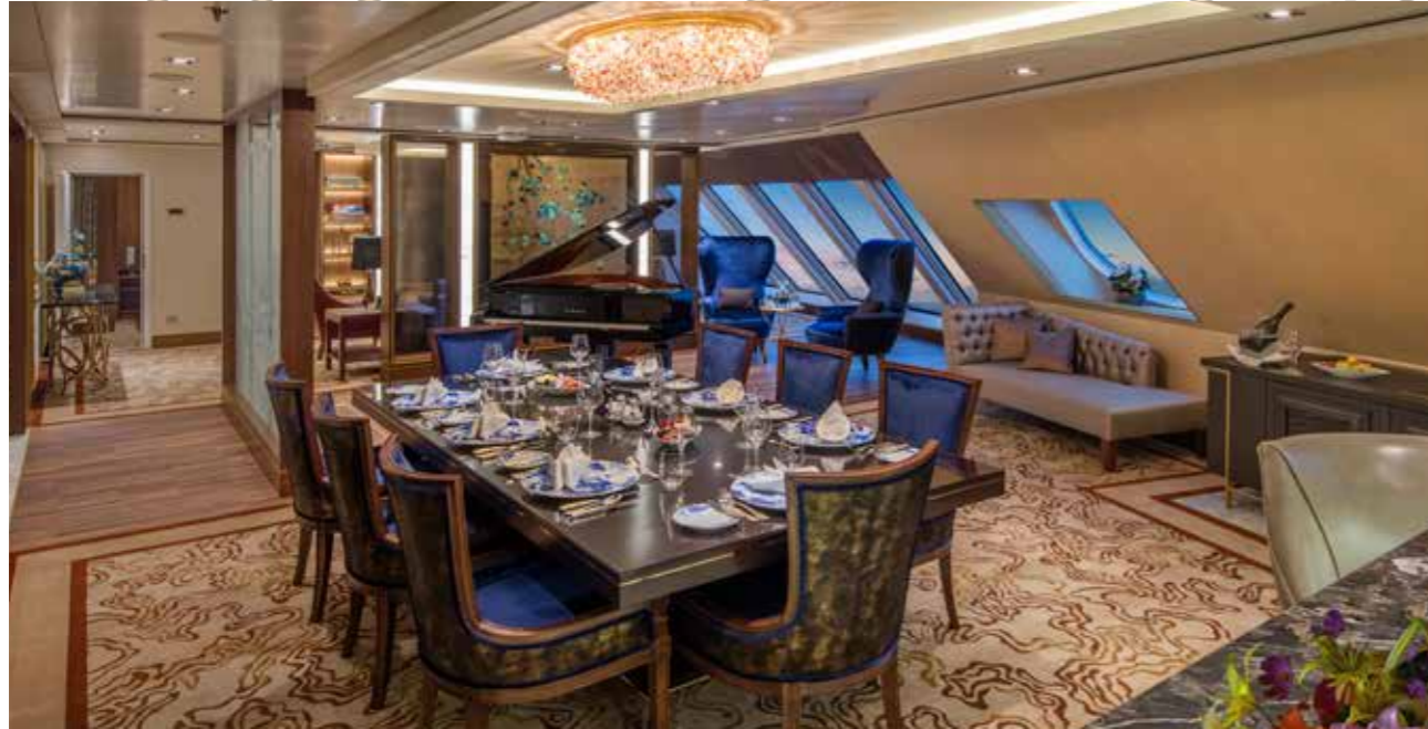
PALACE VILLA Approx. 224 sq.m | Max Occupancy 6 | Deck 17 1 King-size Bed + 1 Queen-size Bed + 1 Double Sofa Bed