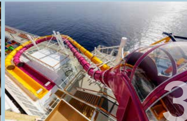
3 WATERSLIDE PARK Get drenched in fun on one of our six different waterslides.