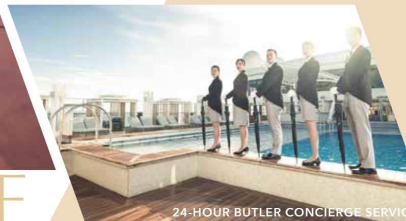
24-HOUR BUTLER CONCIERGE SERVICE