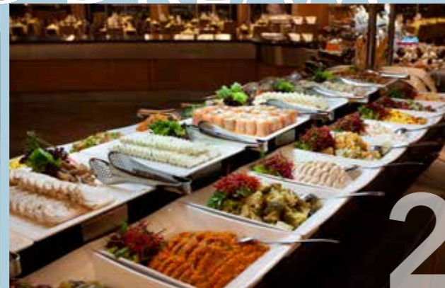
2 THE LIDO Our buffet-style restaurant with a smorgasbord of international and halal cuisine including vegetarian and non-vegetarian Indian dishes.