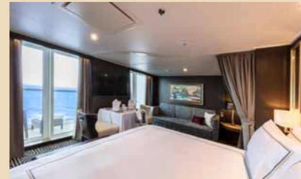
PALACE SUITE From 37 sq.m | Max Occupancy 4 | Deck 13/15/16/17 1 Queen-size Bed + 1 Double Sofa Bed