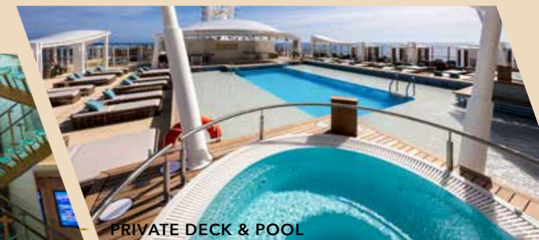
PRIVATE DECK & POOL