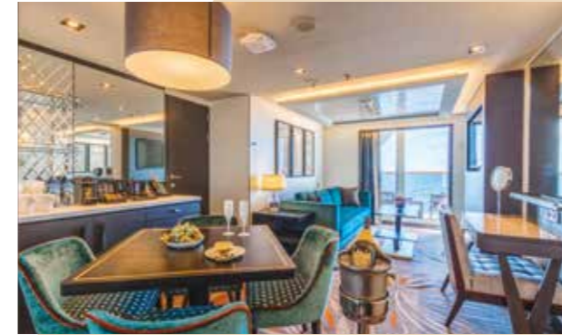
PALACE DELUXE PREMIUM From 41 - 61 sq.m | Max Occupancy 4 | Deck 9/10/11/12/13/15 1 King-size Bed + 1 Double Sofa Bed