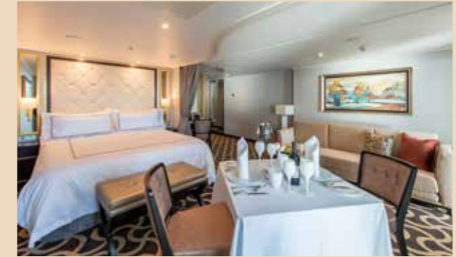
PALACE DELUXE SUITE From 41 sq.m | Max Occupancy 4 | Deck 15 1 Queen-size Bed + 1 Double Sofa Bed