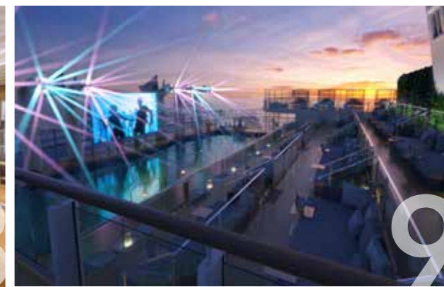
9 RESORTS WORLD BEACH CLUB There's party going on somewhere! Dive in at one of our famous pool parties or dance till dawn to the beat of our guest DJs at Resorts World Beach Club.