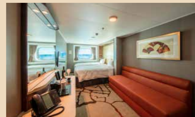
OCEANVIEW STATEROOM From 16 sq.m | Max Occupancy 2 - 4 | Deck 5/9/10/11/12/13 2 Single Beds/ 2 Single Beds + 1 Single Sofa Bed/ 2 Single Beds + 1 Single Sofa Bed + 1 Ceiling Pullman Bed