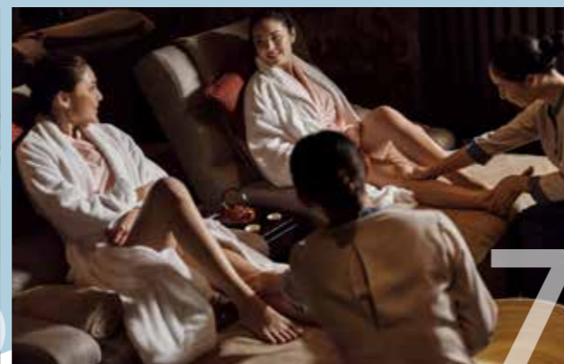
7 CRYSTAL LIFE SPA Rejuvenate mind, body and spirit in our Asian and Western-style spas where you can also enjoy a selection of healthy meals and beverages.