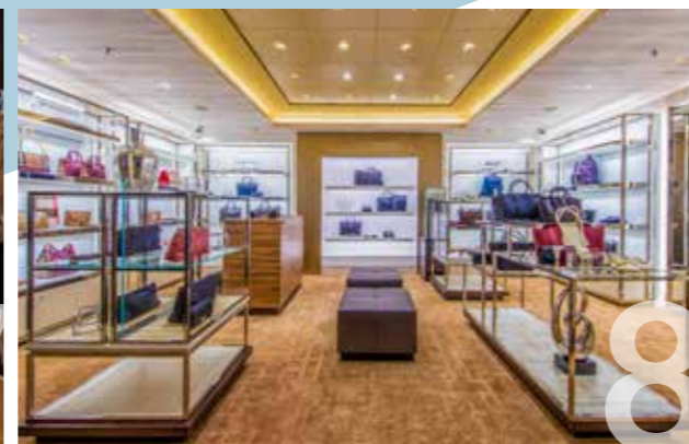
8 THE BOUTIQUES Splurge on International luxury brands at our boutiques or outlet store.