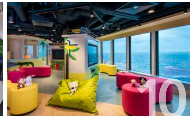
10 LITTLE DREAMERS CLUB Leave the kids with us while you explore the ship. They'll love our exciting line up of activities and classes. For kids aged 2 to 12.