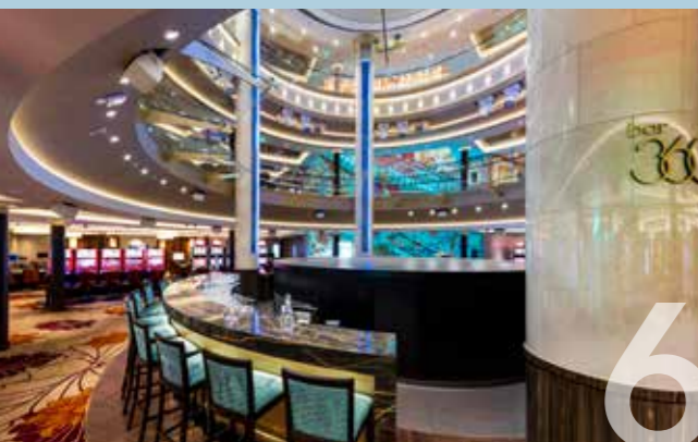
6 BAR CITY Sit back and enjoy world-renowned vintages, premium Scotch whiskies, cocktails or bubbly while we entertain you with performances and live bands.