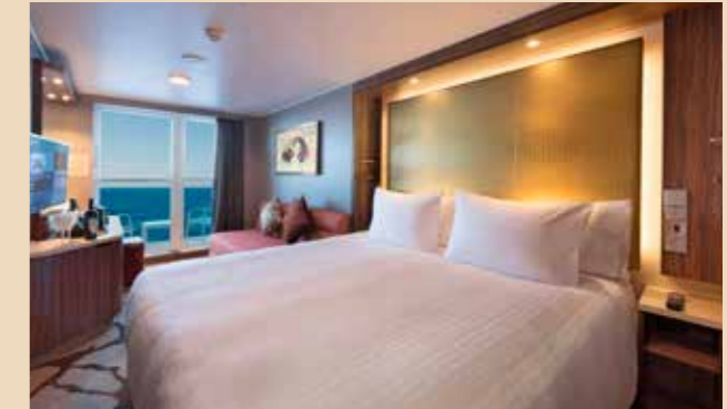
BALCONY / BALCONY DELUXE STATEROOM From 20 sq.m | Max Occupancy 3 - 4 | Deck 8/9/10/11/12/13/15 1 Queen-size Bed + 1 Single Sofa Bed/ 1 Single Sofa Bed + 1 Ceiling Pullman Bed From 22 sq.m | Max Occupancy 3 - 4 | Deck 8/9/10/11/12/13/15 1 Queen-size Bed + 1 Single Sofa Bed/ 1 Single Sofa Bed + 1 Ceiling Pullman Bed