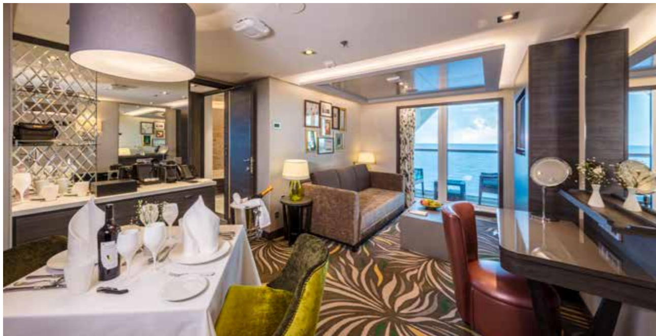
PALACE PENTHOUSE Approx. 37/56 sq.m | Max Occupancy 4 - 6* | Deck 13/16 1 King-size Bed + 1 Double Sofa Bed/ 1 Queen-size Bed + 2 Double Sofa Beds/ 1 Queen-size Bed + 1 Double Sofa Bed