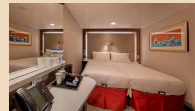
INTERIOR STATEROOM From 13 sq.m | Max Occupancy 2 - 4* | Deck 5/8/9/10/11/12/13/15 2 Single Beds/ 2 Single Beds + 1 Ceiling Pullman Bed/ 1 Single Bed + 1 Pullman Bed + 1 Double Sofa Bed