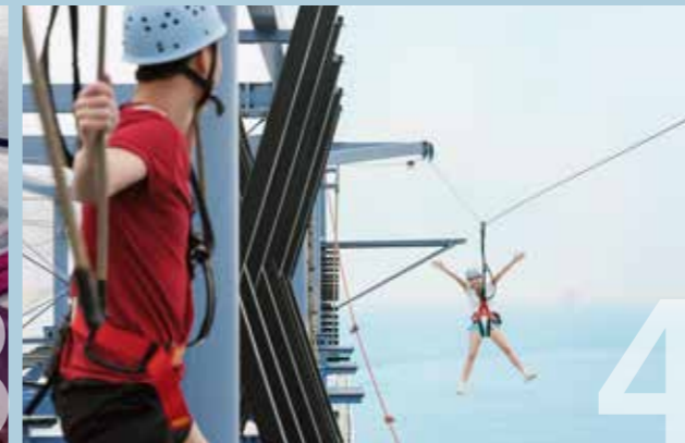
4 ROPE COURSE & ZIPLINE Feel the thrill of gliding above the ocean on a 35-metre zipline.